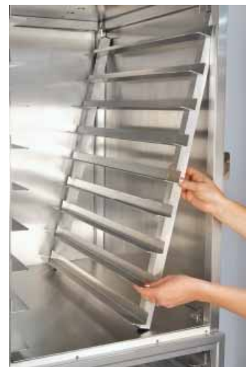
Interior racks are easily removed for cleaning and maintenance