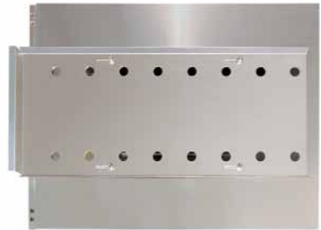
Adjustable vent on top of unit vents heat and moisture

The Piper ER-18 Enclosed Rack is designed to provide an attractive storage cabinet.